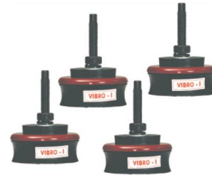
Anti Vibration Pad