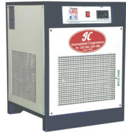
Refrigerator Air Dryer