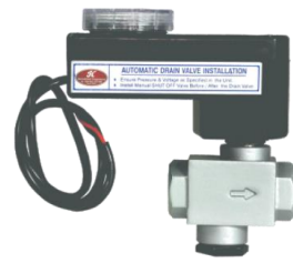
Automatic Drain Valve